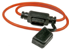
ATM Mini Fuse Holder With Dust Cap & 10" Wire #0965 - 16 GA 10 AMP #0967 - 12 GA 30 AMP