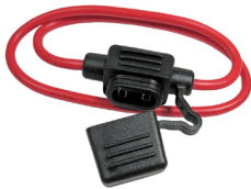
Micro 2 Fuse Holder With Dust Cap & 12" Wire #0959 - 16 GA 10 AMP #0960 - 12 GA 30 AMP