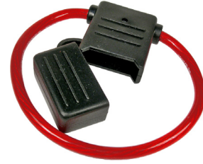
Maxi Fuse Holder PVC With Dust Cap 12" Red 8 Gauge Wire 60 AMP (Does not include fuse)