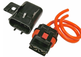
ATM Mini Fuse Holder - #0948 ATC/ATO Fuse Holder - #0950

Weather Resistant Nylon Body With Latching Cap Rubber Seal Protects Fuses 12 AWG 3 to 30 AMP