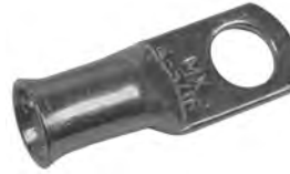
Solid Copper Closed End Lug Rings Solder Or Crimp

Available In Kits - #0003-L & #0004-L (Page 3)