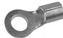
Brazed Copper Ring Terminals Electro-Tin Plated - Max Temperature 295°F Solder Or Crimp