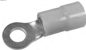
Brazed Copper Ring Terminals Electro-Tin Plated Flared Vinyl Insulation