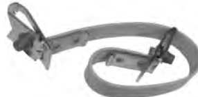
#0867C (#0867PT) Carrier Strap Acid Resistant Vinyl Strap Pickup & Carry Batteries Safely Post & Side Mount Usage