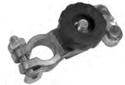
#0846C (#0846PT) Quick Connect Terminal To Disconnect Battery Turn 1/4 Turn Or Remove Knob pos/neg (1/pkg)