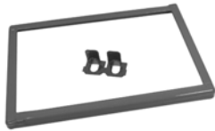
#0855C (#0855PT) Hold Down Frame 10-1/4" x 6-7/8" Perimeter Group 24 Batteries