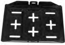
Metal Battery Tray #0850C (#0850PT) 11-1/2" x 8-1/2" #0851C (#0851PT) 14" x 7-7/8"

Metal Construction With Heavy Duty Vinyl Coating Extends Life Of Components