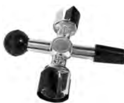
#0889C (#0889PT) 3-Way Post & Terminal Cleaner Design Gives Leverage When Cleaning Post & Terminals