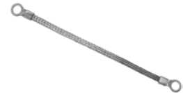
#0868C (#0868PT) 8" Ground Strap 11 Gauge Solves Electrical Problems By Grounding Charging System