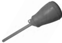
#0847C (#0847PT) Bulb Style Filler 6 oz Fill With 6" Spout