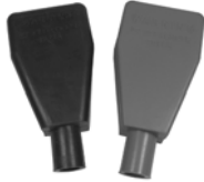
#0849C (#0849PT) Cable Protector Boots Red & Black 4-6 Gauge Reduce Chance Of Short Circuit