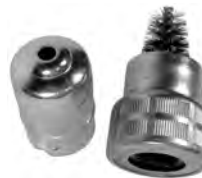
#0890C (#0890PT) Compact Metal Brush Contains 2 Wire Brushes For Post & Terminal Cleaning