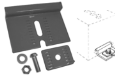
#0858C (#0858PT) Ford Style Base Clamp End Type Base Mount Group Batteries 22NF, 29NF & 24F