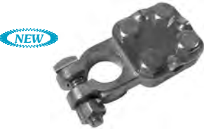
#0809C (#0809PT) 3-Way Top Post Terminal Taps Off Multiple Auxiliary Leads Parallel or Multiple Battery Installations 2 - 1/0 Gauge Lead (1 each pos & neg)