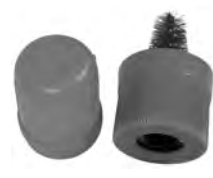
#0891C (#0891PT) Plastic Brush Easy Grip For Cleaning Post & Terminals