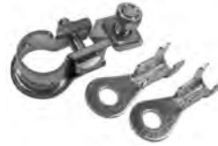
#0866C (#0866PT) Lead Free Terminal OEM Style Replacement - Zinc Plated Copper Light & Medium Duty Applications 6 & 8 Gauge Cable (1 set/pkg)