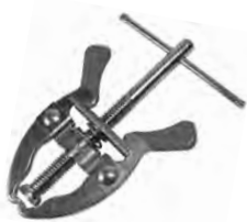
#0681T (#0681PT) Battery Terminal Lifter Lifts Cables Off Battery Post Eliminates Post Damage