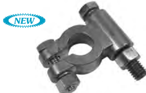
#0810C (#0810PT) Military Type Post Terminal 2-1/2" Extended 3/8" Bolt Lead Terminal (1 each pos & neg)