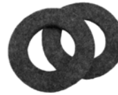
Corrosion Washers Prevent Escape Of Acid Fumes From Battery Post Seals Inhibit Corrosion Grey Felt Material 7/8" ID & 1-1/2" OD