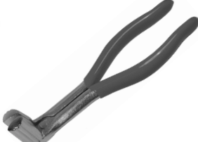
#0682T (#0682PT) Battery Terminal Spreader Forged Steel Construction With Insulated Handles