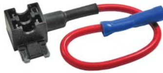
#0955 - Low Profile Fuses