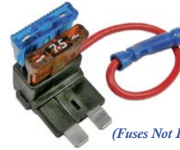
(Fuses Not Included)