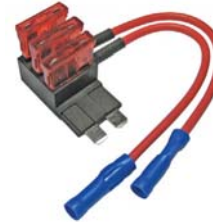
(Fuses Not Included)