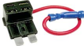
#0957 - ATC/ATO Fuses