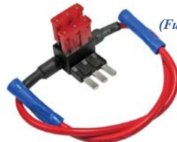
(Fuses Not Included)

Micro3 Dual Lead Plugs Into Existing Fuse Block One Fuse Protects Original Circuit Second Single Fuse Protects Two New Circuits PVC Body With Brass Tin Plated Contacts Red 16 Gauge Wire - 16-14 AWG Butt Connector New Circuits Max 10 AMP at 12 Volts