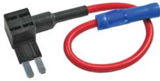
#0954 - ATR Micro2 Fuses