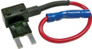
#0956 - ATM Mini Fuses