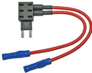
#0943 - ATM Mini Fuses

ATM & ATC/ATO Fuse Adapters Plug Into Existing Fuse Block One Fuse Protects Original Circuit & Two Additional Fuses for Two New Circuits Use Wire Leads For Two New Circuits - Each Circuit Protected by Fuse Closest To It PVC Body With Brass Tin Plated Contacts Red 16 Gauge Wire - 16-14 AWG Butt Connector New Circuits Max 10 AMP at 12 Volts