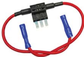
#0953 - Micro3 Blade Fuses