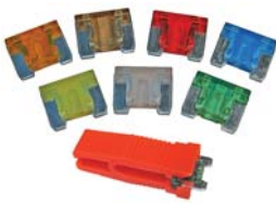
#0977PT - Low Profile Fuses Fuse Puller & 1 ea of 7 Listed Fuses