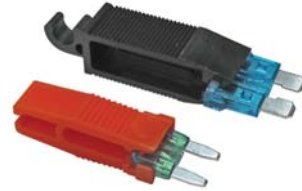
(Fuses Not Included)

Durable Single Piece Construction Pulls and Installs Fuses Black - ATC/ATO Fuses & Glass Fuses 1-7/8" Length Red - Mini, Micro2, Micro3 & Low Profile Fuses 1-1/4" Length