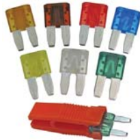
#0978PT - ATR Micro2 Fuses Fuse Puller & 1 ea of 7 Listed Fuses