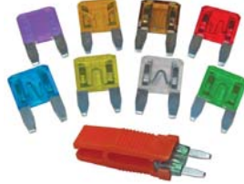
#0976PT - ATM Mini Fuse Fuse Puller & 1 ea of 8 Listed Fuses