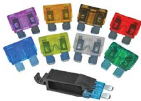
#0975PT - ATC/ATO Fuses Fuse Puller & 1 ea of 8 Listed Fuses