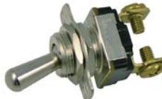
#5576PT (#5576C) On-Off Toggle SPST 1/2" Metal Bat Handle With Indicator Plate 1/2" Mount Hole 120 VAC 6 Amp 240 VAC 3 Amp