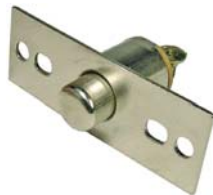
#5507PT (#5507C) Door Alarm Switch Doors - Hoods - Trunks Off When Button Pushed Spring Return to On Dual Mounting Holes 12 Volt 10 Amp