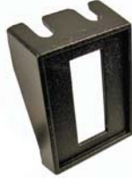
#5502PT (#5502C) Rocker Switch Panel 1/2" x 1-3/16" Rectangular Hole 1-3/8" x 1-5/8" Black Modular Style