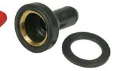
#5570PT (#5570C) Weather Resistant Boot With 1/2" Mounting Nut and Washer Fits 3/8" - 5/8" Length Toggle Switches

On-Off Toggle SPST Illuminated Nylon Housing 1/4" Male Tabs 1" Handle Length 1/2" Mount Hole 12 Volt 16 Amp