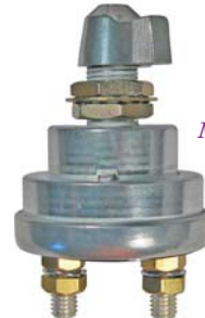
#5574PT (#5574C) Master Battery Disconnect 2 3/8" Brass Stud Terminals 3/4" Mount Hole For Battery Circuit Only On - Off SPST 6-36 Volt 190 Amp DC Continual 1000 Amp DC Momentary