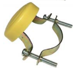
#5505PT (#5505C) Horn Button 1-3/4" Diameter Ivory Button 2 #6 Screw Contacts Bracket with Screws Fits Up To 1-1/2" Steering Column 12 Volt 5 Amp