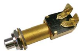
#5527PT (#5527C) Brass Marine Push-Button Momentary On SPST Starter & Horn Switch Chrome Plated Brass Button 2 Brass Screw Terminals 1-1/4" x 5/8" Mounting Stem 6 Volt 25 Amp 12 Volt 15 Amp