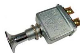
#5522PT (#5522C) On-Off Push-Pull SPST Heavy Duty Chrome Plated Metal Knob 2 Copper Terminals with 2 Brass Screws 1/2" Mount Hole 6-28 Volt 75 Amp