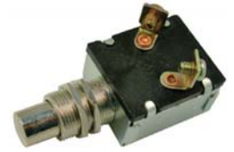
#5512PT (#5512C) Push Button Momentary On 5/8" Mount Hole 6 Volt 25 Amp 12 Volt 15 Amp