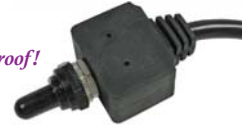
#5589PT (#5589C) Momentary On-Off- Momentary On Toggle SPDT - 3 Position Waterproof Bat Handle With Boot 3 6" 16Ga Jacketed Wire Leads 1/2" Mount Hole 12 Volt 25 Amp