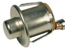
#5508PT (#5508C) Momentary Grounding Switch Push Button Momentary On Self Grounding in Metal Panel With .157" Bullet Receptacle Snaps Into 15/16" Hole 6 Volt 15 Amp 12 Volt 10A / 24 Volt 6A