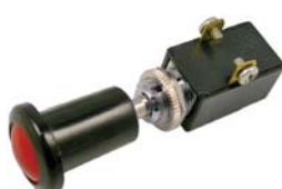
#5520PT (#5520C) On-Off Push-Pull SPST 1" Handle Pulls For On Red Illuminated 2 Screw Terminals 1/2" Mount Hole 6 Volt 25 Amp 12 Volt 15 Amp Uses Bulb #282