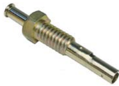
#5506PT (#5506C) Door Jamb Switch Self Grounding in Metal Panel Contact Open when Plunger Depressed & Spring Return to Ground & Closed Contact 3/8" Travel Length - 2" Overall .157" Bullet Receptacle End 12 Volt 1 Amp