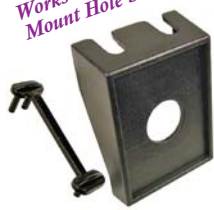
#5501PT (#5501C) Toggle Switch Panel 1/2" Hole Diameter 1-3/8" x 1-5/8" Black Modular Style