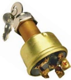
#5529PT (#5529C) Brass Heavy Duty Ignition Starter Switch Accessory-Start-Off 3 Brass Screw Terminals 1-1/8" x 13/16" Mounting Stem 6 Volt 25 Amp 12 Volt 15 Amp