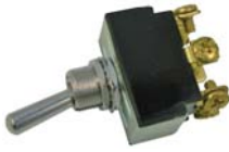
#5549PT (#5549C) On-Off-On Toggle DPDT 3/4" Handle Length 6 Screw Terminals 12 Volt 25 Amp 125 VAC 20 Amp