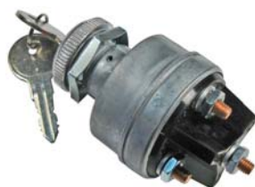
#5503PT (#5503C) Ignition Switch - 2 keys Accessory-Off-Ignition-Start 3/4" Mount Hole Heavy Duty Plated Steel 4 #10 Stud Copper Terminals 12 Volt 30 Amp