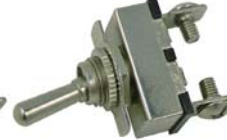
#5578PT (#5578C) Momentary On-Off Toggle SPST 5/8" Metal Bat Handle With Indicator Plate 1/2" Mount Hole 12 Volt 20 Amp