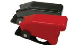
Toggle Safety Cover Spring Loaded Design Fits Most Bat Style Toggles #5568PT (#5568C) Red #5569PT (#5569C) Black