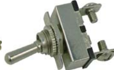
#5577PT (#5577C) On-Off Toggle SPST 5/8" Metal Bat Handle With Indicator Plate 1/2" Mount Hole 12 Volt 20 Amp