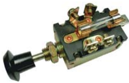
#5514PT (#5514C) Push-Pull Headlamp Switch with 15 Amp Fuse 3 Position Off-On-On Pull For On 5 Screw Terminals 3/8" Mount Hole 12 Volt 15 Amp