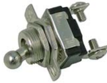
#5511PT (#5511C) On-Off Toggle SPST 1/4" Metal Ball Handle With Indicator Plate 1/2" Mount Hole 12 Volt 10 Amp 125 VAC 5 Amp