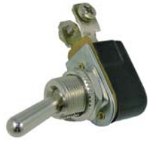
#5510PT (#5510C) On-Off Toggle SPST 3/4" Metal Bat Handle 1/2" Mount Hole 12 Volt 15 Amp 125 VAC 10 Amp

All Packaged One Per Pack - Consult Price Sheet For Bulk Packaging