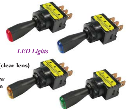
#5560PT (#5560C) - Red (clear lens) #5561PT (#5561C) - Blue #5562PT (#5562C) - Amber #5563PT (#5563C) - Green

On-Off Toggle SPST LED Illuminated Tip Black Nylon Housing 1/4" Male Tabs 1" Handle Length 1/2" Mount Hole 12 Volt 10 Amp