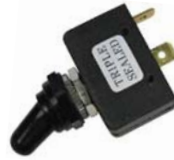
#5513PT (#5513C) On-Off Toggle w/Boot Nut 2 Position - 2 Terminal 3/4" Handle Length 2 1/4" Male Tabs Moisture Proof Metal Body - Dipped 12 Volt 20 Amp