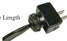
#5540PT (#5540C) On-Off SPST

Black Toggle Black Nylon Housing 1/4" Male Tabs / 1" Handle Length 1/2" Mount Hole 12 Volt 16 Amp