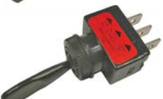
#5542PT (#5542C) On-Off-On SPDT

Heavy Duty Toggle Chrome Plated With Copper Screw Terminals Die Cast Housing With Indicator Plate 1/2" Mount Hole / 1" Handle Length 6-12 Volt 50 Amp