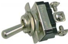
#5546PT (#5546C) On-Off-On Toggle SPDT 5/8" Metal Bat Handle With Indicator Plate 1/2" Mount Hole 12 Volt 10 Amp 3/4 HP 120-240 VAC