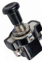
#5579PT (#5579C) Euro On-Off Push-Pull Short Style SPST Plastic Knob With 2 M3 Screws 5/16" Mount Hole 12 Volt 16 Amp