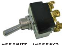
#5558PT (#5558C) Moment On-Off-Moment On DPDT Toggle 3/4" Handle Length 6 Screw Terminals 12 Volt 25 Amp 125 VAC 20 Amp