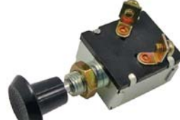
#5521PT (#5521C) On-Off Push-Pull SPST 2 Screw Terminals 1/2" Mount Hole 6 Volt 25 Amp 12 Volt 15 Amp