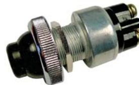
#5509PT (#5509C) Heavy Duty Push Button Momentary On Rubber Dust & Moisture Resistant Boot Nut 5/8" Mount Hole 12 Volt 60 Amp