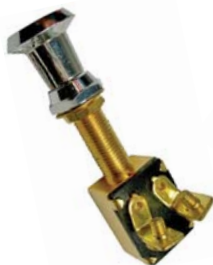
#5528PT (#5528C) Brass Marine Push-Pull On-Off SPST Switch Chrome Plated Knob 2 Brass Screw Terminals 1-1/4"x3/8" Mounting Stem 6 Volt 25 Amp 12 Volt 15 Amp