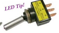
#5571PT (#5571C) On-Off Toggle SPST Red LED Lighted Tip Brushed Aluminum Handle 7/8" Handle Length 1/2" Mount Hole 12 Volt 15 Amp