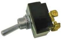
#5548PT (#5548C) On-Off Toggle DPST 3/4" Handle Length 4 Screw Terminals 12 Volt 25 Amp 125 VAC 20 Amp