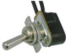
#5547PT (#5547C) On-Off Toggle SPST 3/4" Metal Bat Handle With Indicator Plate 2-16 ga Wire Leads 12 Volt 15 Amp 125 VAC 10 Amp