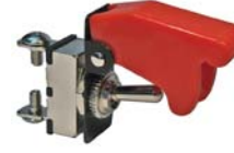
#5599PT (#5599C) Red Toggle Cover & On-Off Toggle (#5568 + #5577) 1/2" Mount Hole 12 Volt 20 Amp