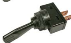
#5541PT (#5541C) Momentary On-Off SPST