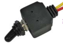
#5588PT (#5588C) On-Off Toggle SPST Waterproof Bat Handle With Boot 2 6" 16 Ga Wire Lead 1/2" Mount Hole 12 Volt 25 Amp