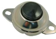
#5504PT (#5504C) Horn Button Flush Mount 2 #6 Screw Contacts Nickel Plated Housing Black Plastic Button 12 Volt 5 Amp